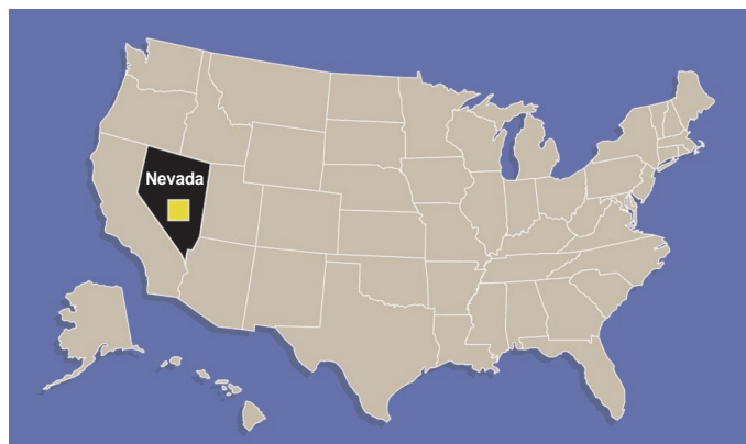
Fig. 1 (above). Calculated area required for a PV system to produce the entire U.S. yearly electrical needs. Fig. 2 (right). Sustainable pathways from solar energy to H 2 .

H 2 as the energy carrier is a much better approach. On-board H 2 would allow a vehicle to maximize the energy-efficient aspects of fuel cells and the environmental attributes of H 2 . The near-term approach would be to build stationary reformers at current compressed natural gas filling stations. Because it would run continuously, putting the same small-scale reformer on the ground would spread the cost over a larger number of consumers and would minimize development costs (14). Initially, the H 2 would be used in