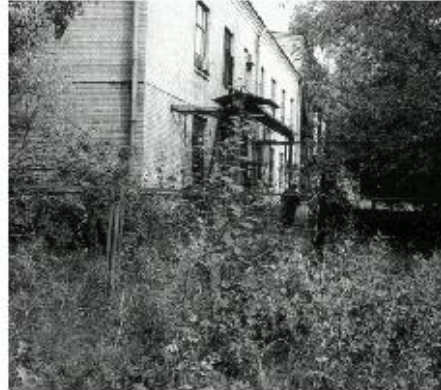
Building at the Kurchatov Institute housing HEU with no motion sensors, detectors, or portal monitors.